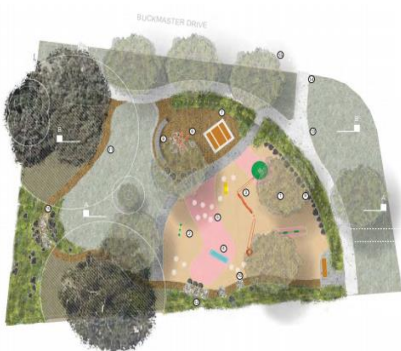
Figure 1: Concept design

You can find out about other Growing Suburbs Fund projects at https://www.localgovernment.vic.gov.au/grants/growin-g-suburbs-fund