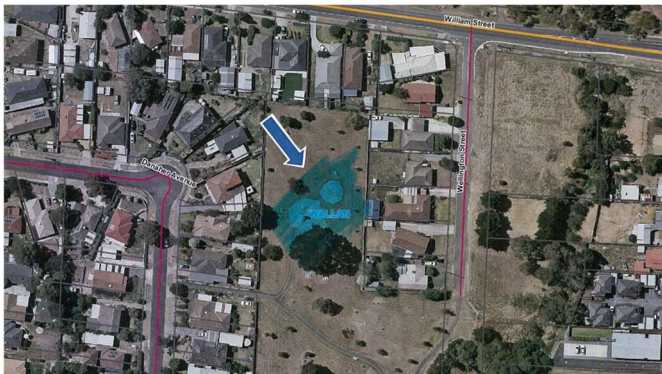
Figure 1 – Danaher Reserve - Project location

Mitchell Shire Council received a total of $4.97 million for seven projects under the Growing Suburbs Fund 2018 – 2019.