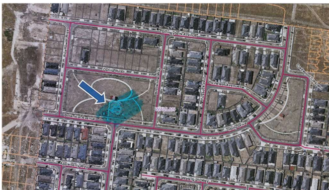
Figure 2 – Botanical Avenue – Project location

Growing Suburbs Fund contributes to a mix of infrastructure projects that have a direct benefit to communities living in the outer suburbs.