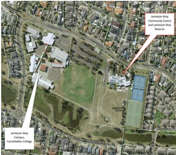
Figure 1 – Aerial image of the project location