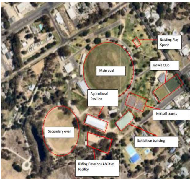
Figure 1 – Aerial image of project site