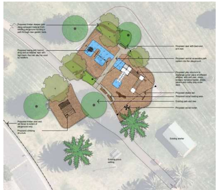
Figure 2 – Concept design

You can find out about other Growing Suburbs Fund projects at https://www.localgovernment.vic.gov.au/grants/growing-suburbs-fund .