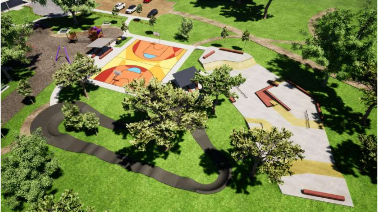
Figure 1 – Draft Concept Plan

You can find out about other Growing Suburbs Fund projects at https://www.localgovernment.vic.gov.au/grants/growing-suburbs-fund .