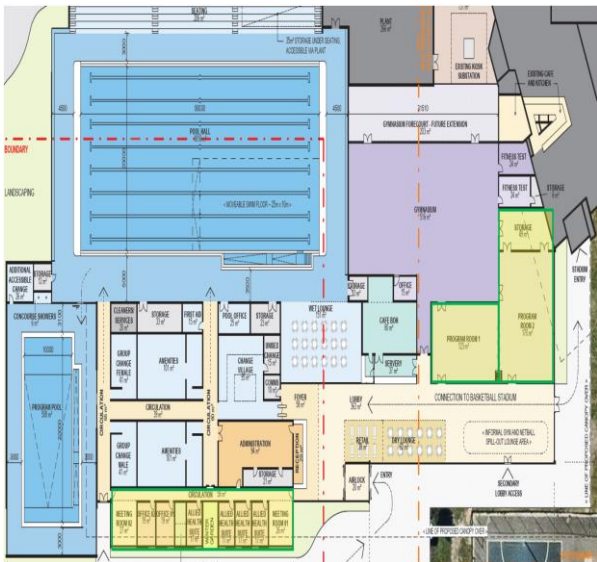
Figure 1: Concept design