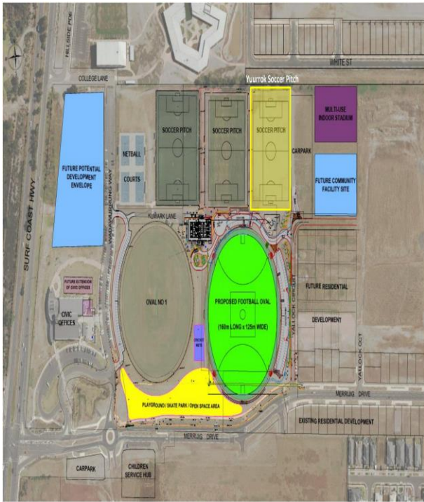
Figure 2: Concept design - Aerial view

You can find out about other Growing Suburbs Fund projects at https://www.localgovernment.vic.gov.au/grants/growing-suburbs-fund