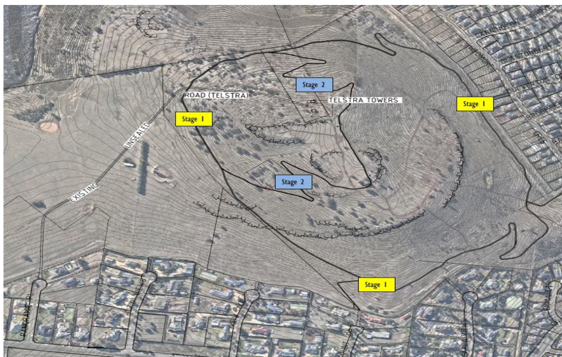
Figure 1 – Site and trail layout

You can find out about other Growing Suburbs Fund projects at https://www.localgovernment.vic.gov.au/grants/growing-suburbs-fund