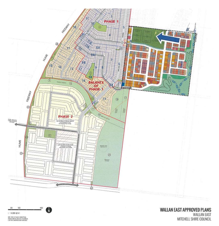
Figure 1 - Project location

Total Project Cost: $2,170,032 Growing Suburbs Fund: $2,170,032