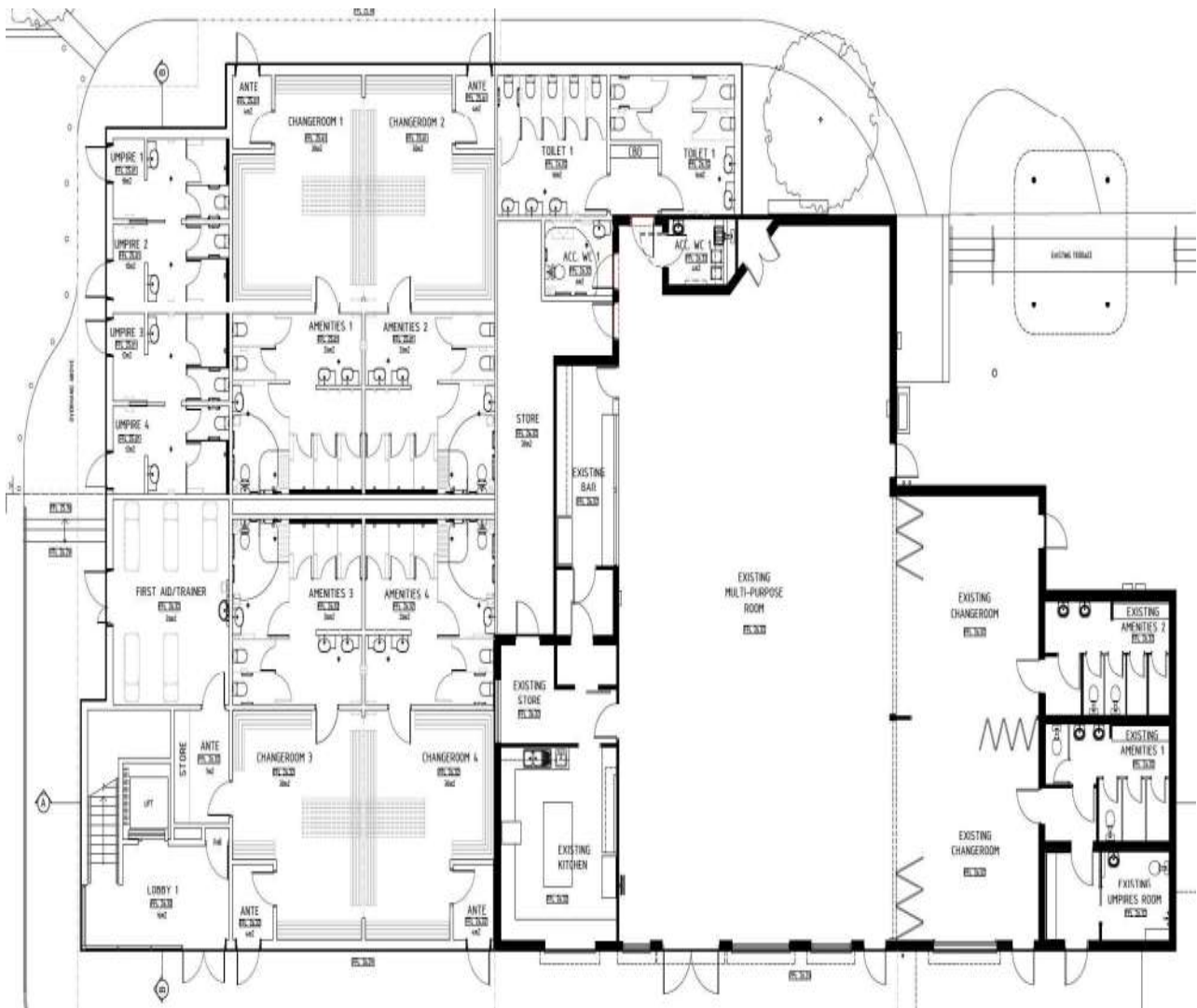
Figure 1 Floor plan

You can find out about other Growing Suburbs Fund projects at https://www.localgovernment.vic.gov.au/grants/growing-suburbs-fund .