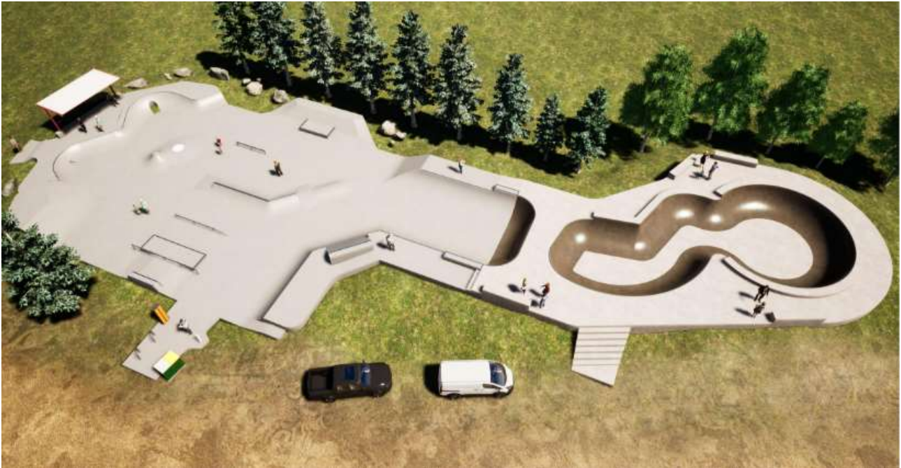
Figure 1 Concept Design

You can find out about other Growing Suburbs Fund projects at https://www.localgovernment.vic.gov.au/grants/growing-suburbs-fund .