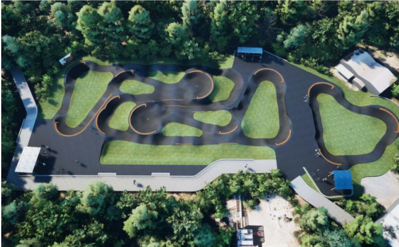
Figure 1: Concept design

You can find out about other Growing Suburbs Fund projects at https://www.localgovernment.vic.gov.au/grants/growing-suburbs-fund