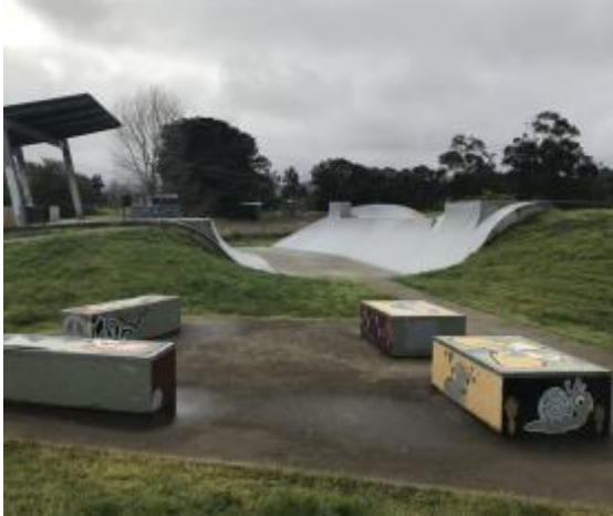
Figure 1: Existing conditions (Whittlesea City Council)

Expected date of commencement: July 2020