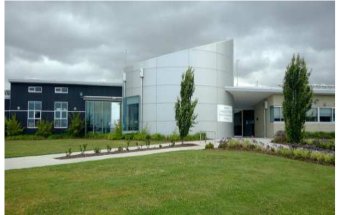
Figure 1: Marriott Waters Family and Community Centre Redevelopment – External view