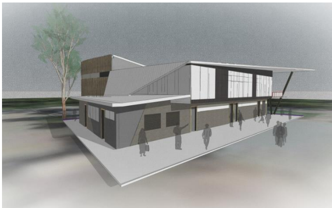
Figure 1 – 3D Perspective / Artist Impression (Yarra Ranges Shire Council)

Mount Evelyn Sport and Community Hub Group $200,000