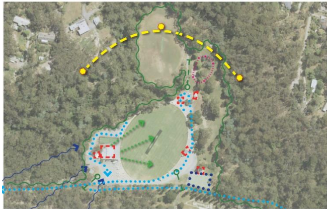
Figure 2 – Site Analysis Map (Yarra Ranges Shire Council)

Other projects in Yarra Ranges Shire Council to receive funding from the 2019-2020 Growing Suburbs Fund are: