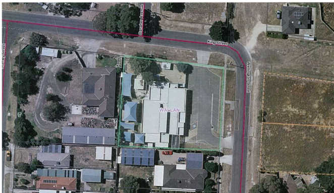
Figure 1 – Project location

Mitchell Shire Council received a total of $4.97 million for seven projects under the Growing Suburbs Fund 2018 – 2019.