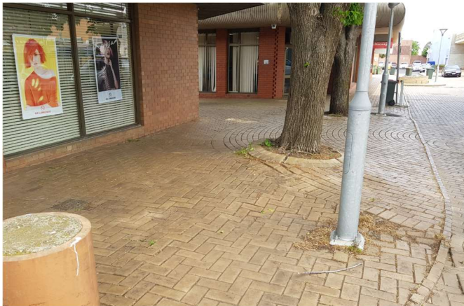
Figure 2: Current laneway layout