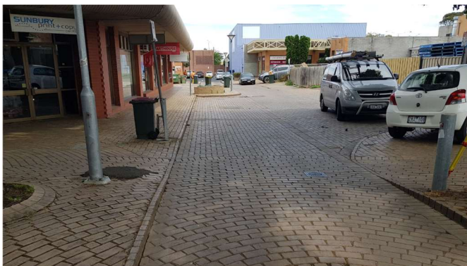
Figure 3 Current laneway layout