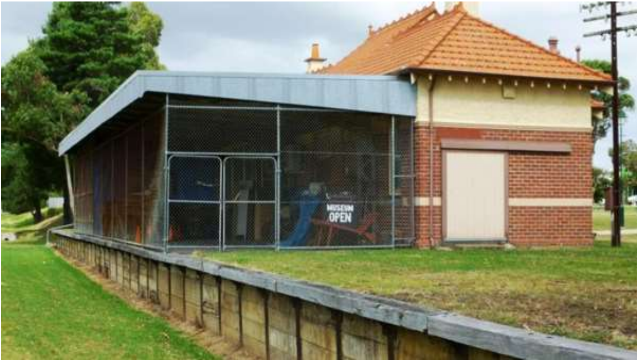
Figure 1 Project Site Wonthaggi Rail Platform

You can find out about other Growing Suburbs Fund projects at https://www.localgovernment.vic.gov.au/grants/growing-suburbs-fund .