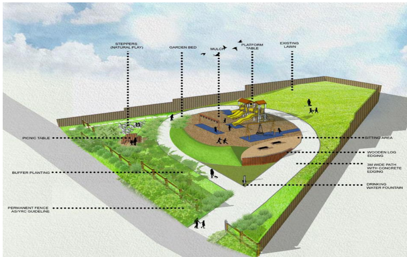
Figure 1: Concept design AQL Landscape Design

You can find out about other Growing Suburbs Fund projects at https://www.localgovernment.vic.gov.au/grants/growing-suburbs-fund