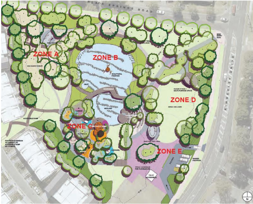
Figure 1: Concept design

You can find out about other Growing Suburbs Fund projects at https://www.localgovernment.vic.gov.au/grants/growing-suburbs-fund