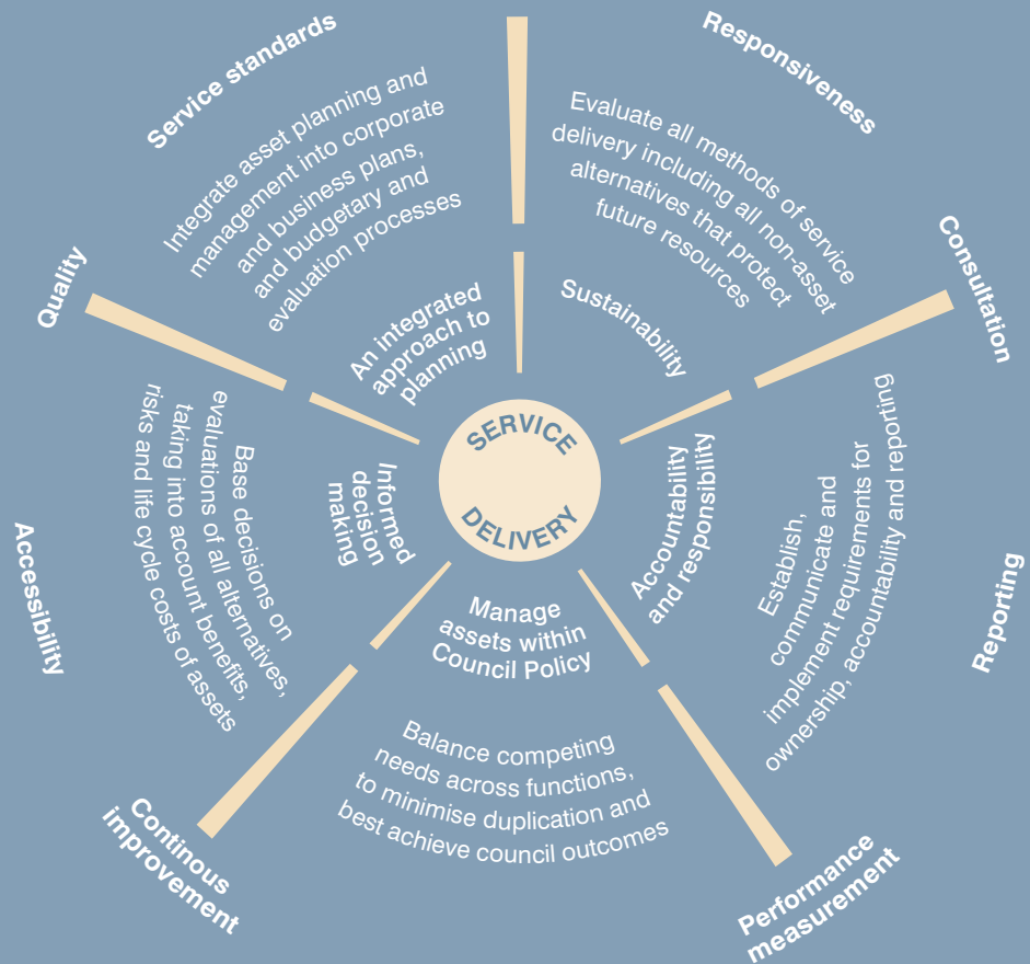
Figure 1 - Service Delivery Model

Figure one illustrates the central principle that service delivery needs form the basis of asset management practices and decisions, within the context of Best Value Victoria .