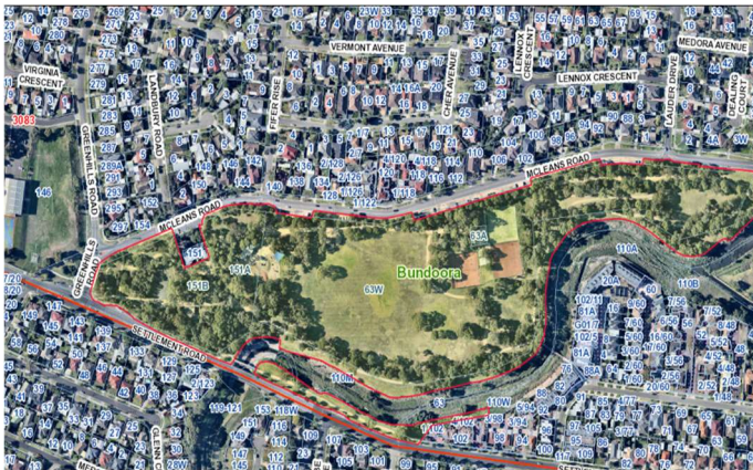
Figure 1: Site Overview

Growing Suburbs Fund contributes to a mix of infrastructure projects that have a direct benefit to communities living in the outer suburbs.