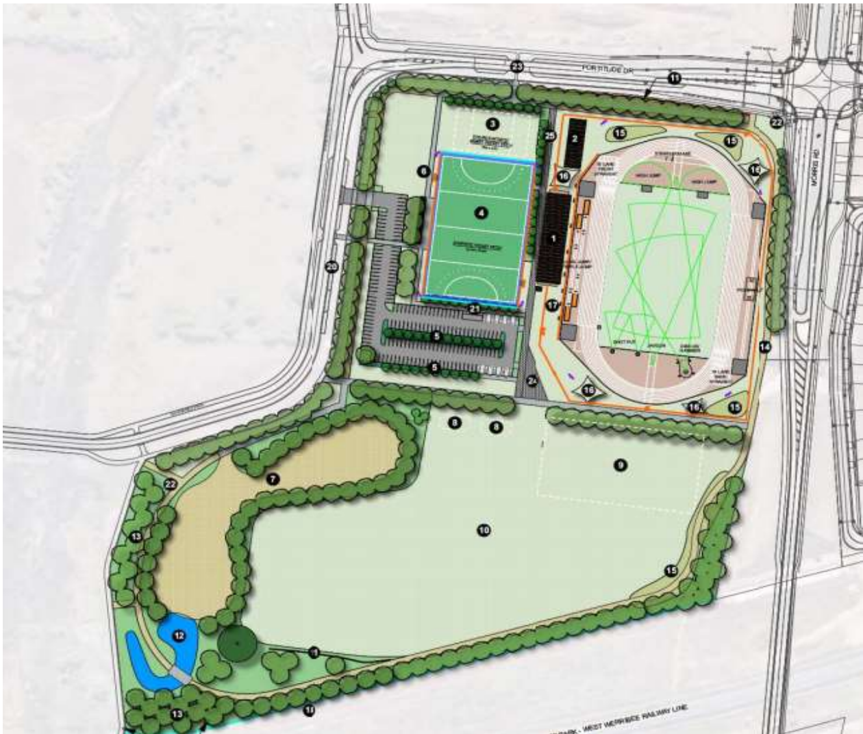
Figure 1 – Stage One Schematic Plan

You can find out about other Growing Suburbs Fund projects at https://www.localgovernment.vic.gov.au/grants/growing-suburbs-fund .