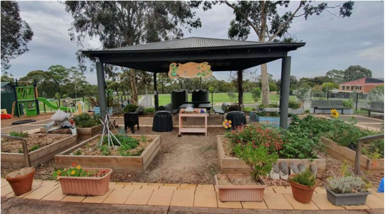
Figure 1 Project Site

You can find out about other Growing Suburbs Fund projects at https://www.localgovernment.vic.gov.au/grants/growing-suburbs-fund .