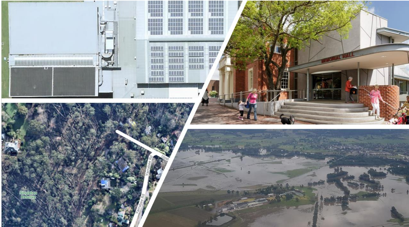
Figure 1: Project image

You can find out about other Growing Suburbs Fund projects at https://www.localgovernment.vic.gov.au/grants/growing-suburbs-fund