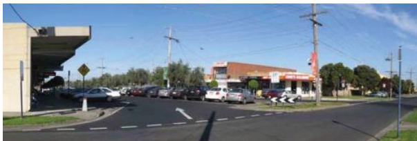
Figure 2: Existing intersection conditions (Whittlesea City Council)