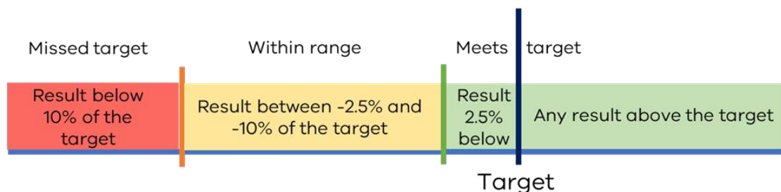
Graph 3.1 – Threshold range applied to development focussed measures.