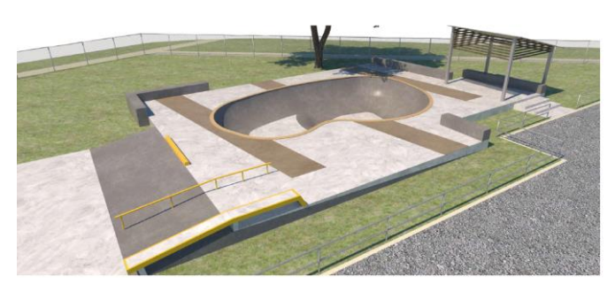
Figure 2 – Design Proposal – Bowl and Shelter (Yarra Ranges Shire Council)