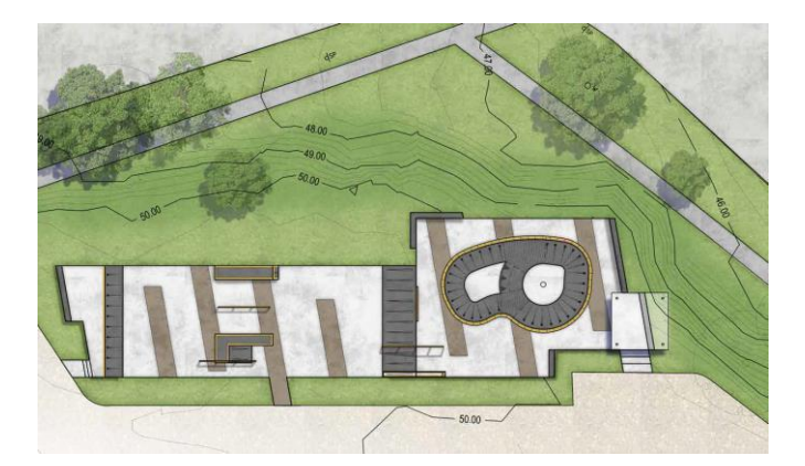
Figure 1 – Design Proposal – Areal View (Yarra Ranges Shire Council)

Total Project Cost: $600,000 Growing Suburbs Fund: $300,000 Other contributions: Yarra Ranges Shire Council $300,000