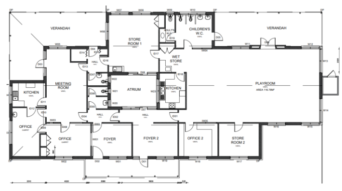
Figure 2: Tyabb Kindergarten Concept plan (Mornington Peninsula Shire Council)

Other projects in Mornington Peninsula Shire Council to receive funding from the 2019-20 Growing Suburbs Fund are: