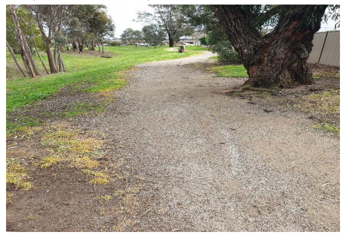
Figure 1 – Taylors Creek Shared Path – Current conditions (Mitchell Shire Council)

© The State of Victoria Department of Environment, Land, Water and Planning 2020 This work is licensed under a Creative Commons Attribution 4.0