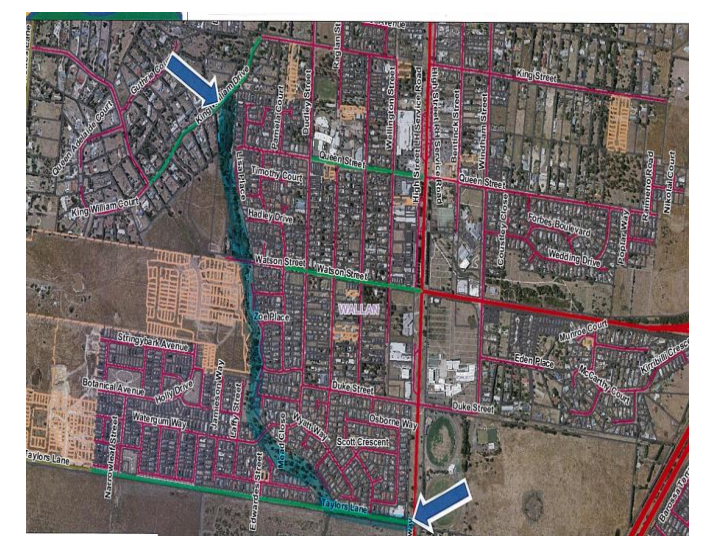
Figure 1 – Taylors Creek Shared Path – Location highlighted in blue (Mitchell Shire Council)

Total Project Cost: $1,786,445 Growing Suburbs Fund: $1,688,050 Other contributions: Mitchell Shire Council $98,395